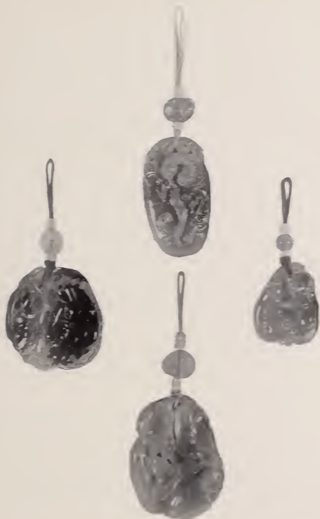
PENDANTS OF CARVED JADE AND OTHER STONES